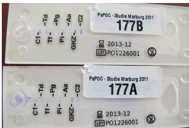
FIGURE 2 Picture of a test slide of CST